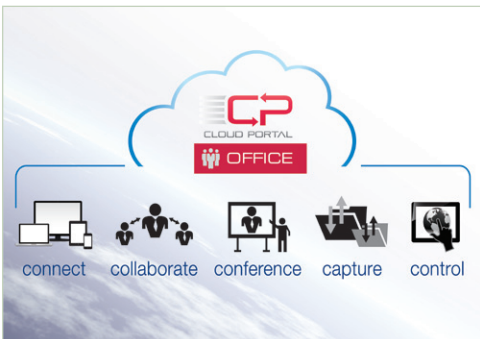
Work more efficiently and collaborate more easily with Sharp Cloud Portal Office.