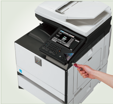
An easily accessible USB connector allows for simplified printing of PDF files from common USB thumb drives.