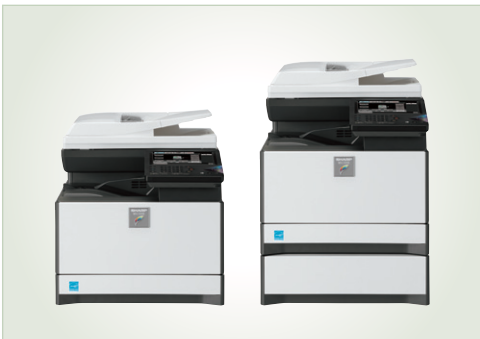
Expandable paper capacity stores up to 800 sheets.