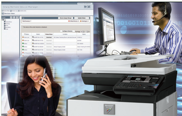
Sharp Remote Device Manager.