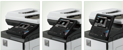
Multi-position tilt screen allows for adjustment to a convenient viewing position.