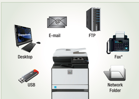
Sharp's integrated network scanning offers one-touch document distribution to multiple destinations.