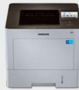
M4530NX (45 ppm)