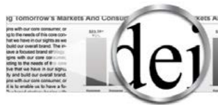
De-ICE (Integrated Cavity Effect)