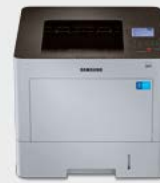
M4530ND (45 ppm)